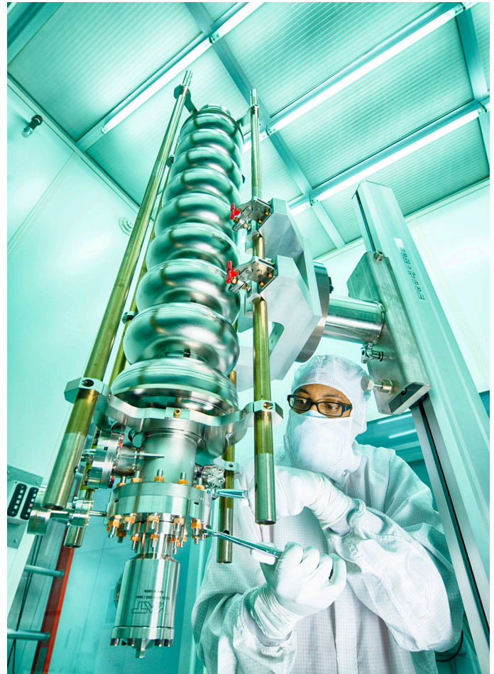
Cooled to minus 456 degrees Fahrenheit, these niobium cavities allow radiofrequency fields to boost electron energies without electrical resistance. Cryomodules—consisting of eight niobium cavities each—are a key component of LCLS-II's superconducting linear accelerator.

At the beam switchyard, electron beams from each linac will be directed to one of two new undulators to produce hard or soft X-ray laser pulses. The pulses then travel to experimental halls where scientists conduct research.