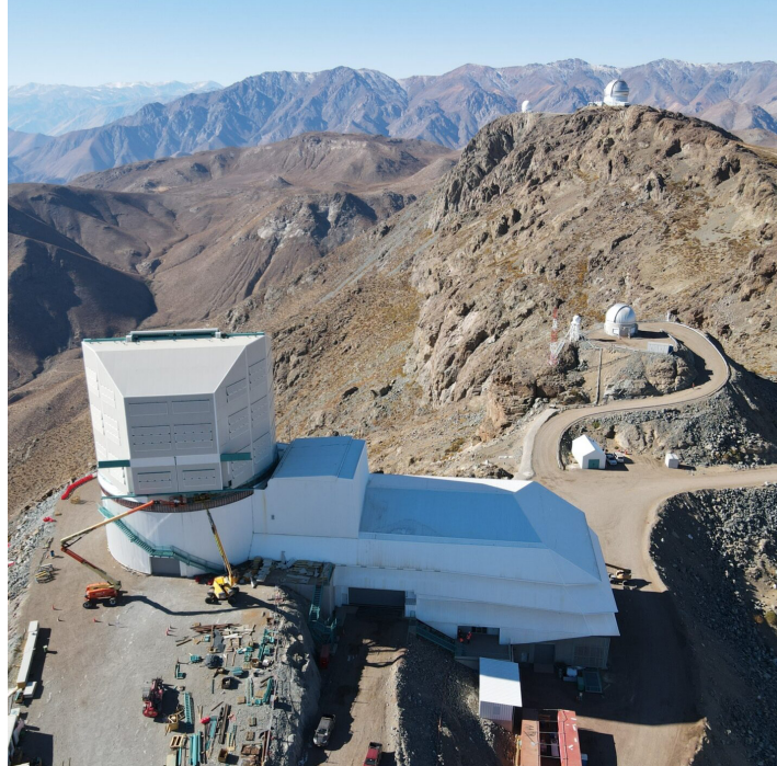
The Rubin Observatory, which will take nearly a decade to complete, has a unique appearance compared to other observatories due to its large support building that will act as a maintenance shop for the supersized camera and telescope.