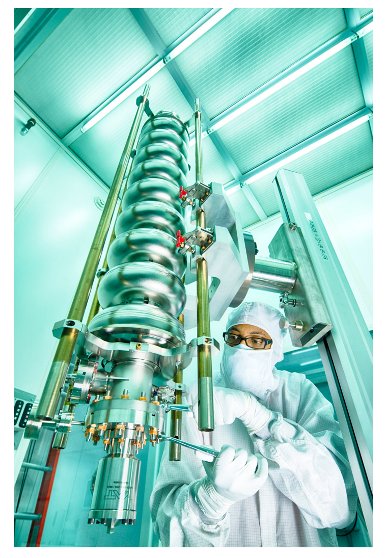
Cooled to minus 456 degrees Fahrenheit, these niobium cavities allow radiofrequency fields to boost electron energies without electrical resistance. Cryomodules— consisting of eight niobium cavities each—are a key component of LCLS-II's superconducting linear accelerator.

The Linac Coherent Light Source at SLAC National Accelerator Laboratory is an Office of Science User Facility operated for the Department of Energy by Stanford University.