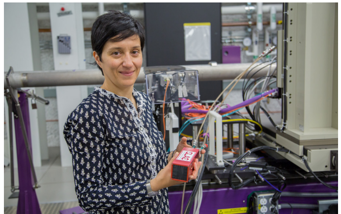
Below: SLAC researchers develop advanced detectors with extraordinary sensitivity and resolution for cutting-edge research in ultrafast science.